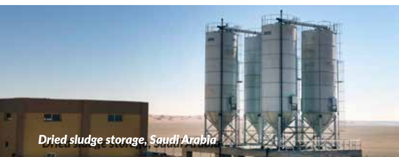
Dried sludge storage, Saudi Arabia