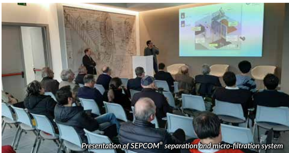
Presentation of SEPCOM® separation and micro-filtration system

The Associazione Meccanica organises some 25 events a year, including visits to companies, conferences on mechanical, mechatronic, automation, organisational, management, plant engineering, regulatory and innovation topics, courses on matters of professional interest, as well as social and cultural events.