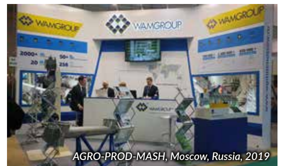
AGRO-PROD-MASH, Moscow, Russia, 2019