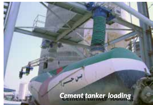
Cement tanker loading