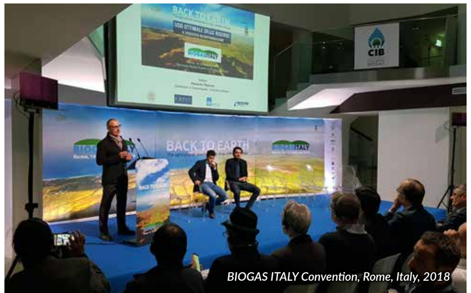
BIOGAS ITALY Convention, Rome, Italy, 2018