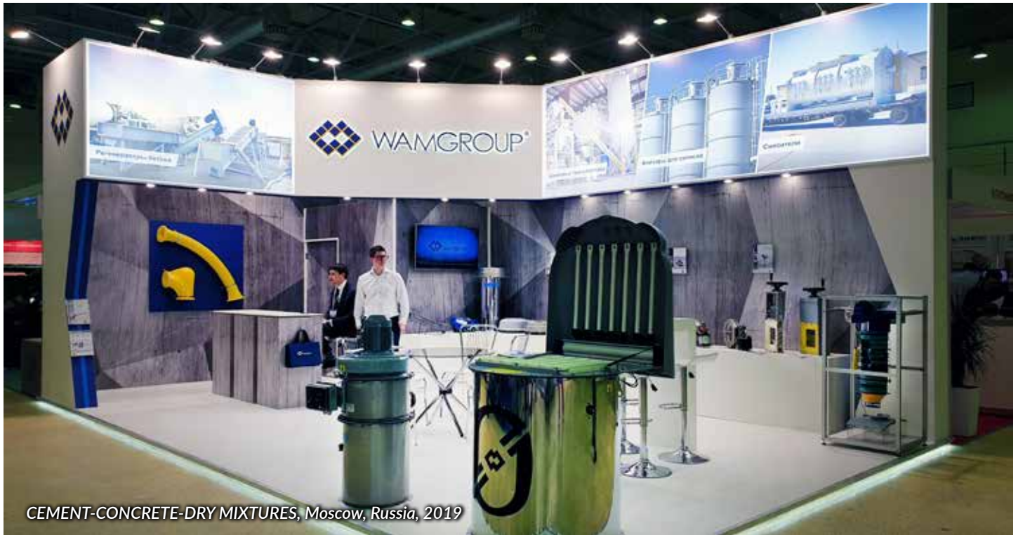
CEMENT-CONCRETE-DRY MIXTURES, Moscow, Russia, 2019

Yes, there were times when trade fairs and conferences were still held. However, since the Coronavirus pandemic almost all events worldwide have been postponed—some of them several times—or even cancelled completely.