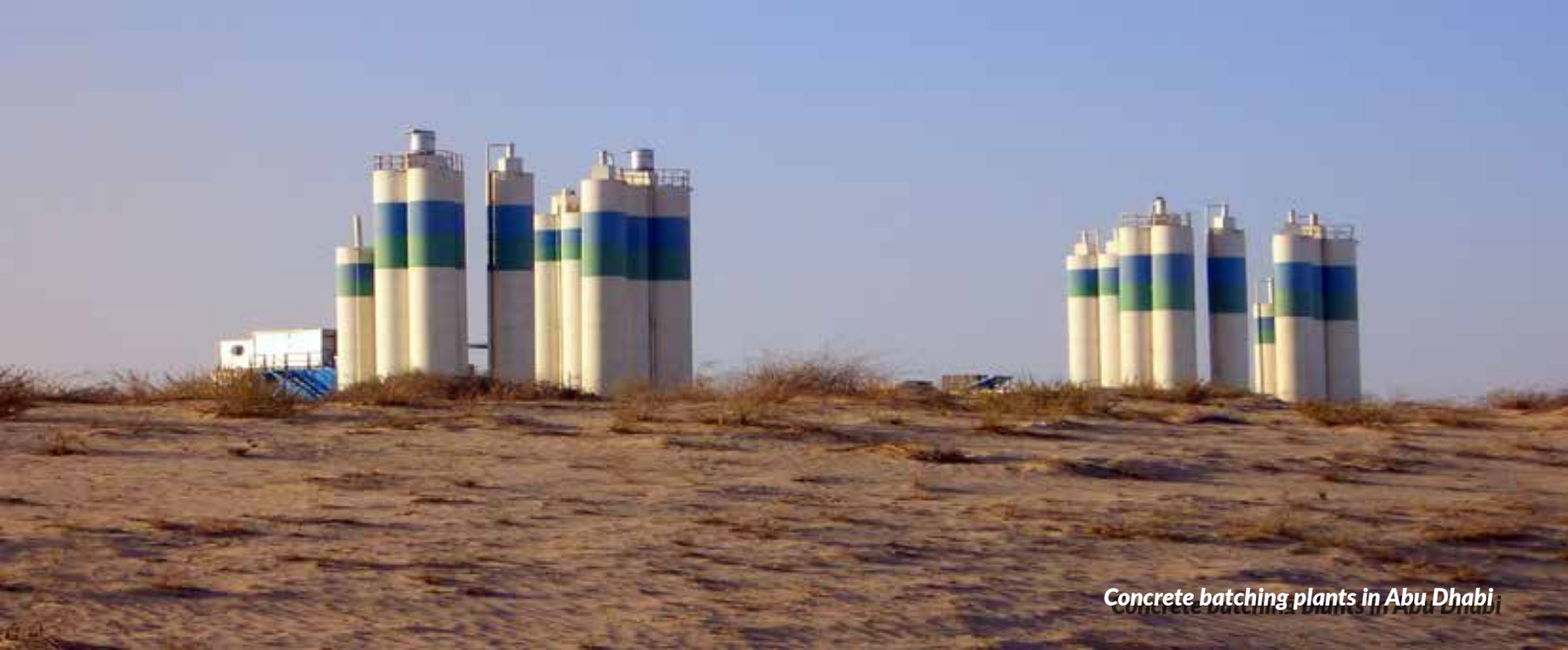
Concrete batching plants in Abu Dhabi