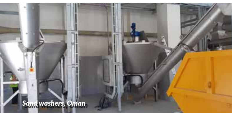
Sand washers, Oman