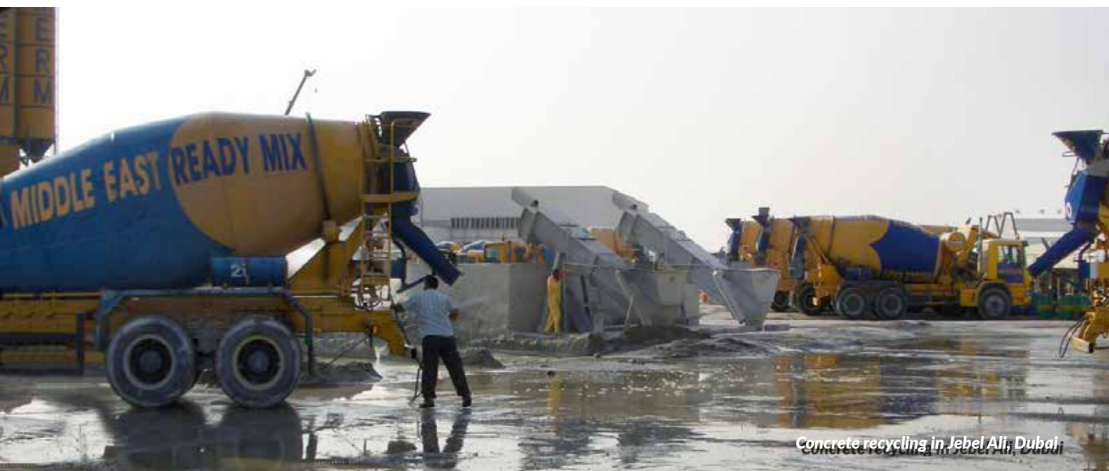
Concrete recycling in Jebel Ali, Dubai