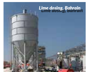
Lime dosing, Bahrain