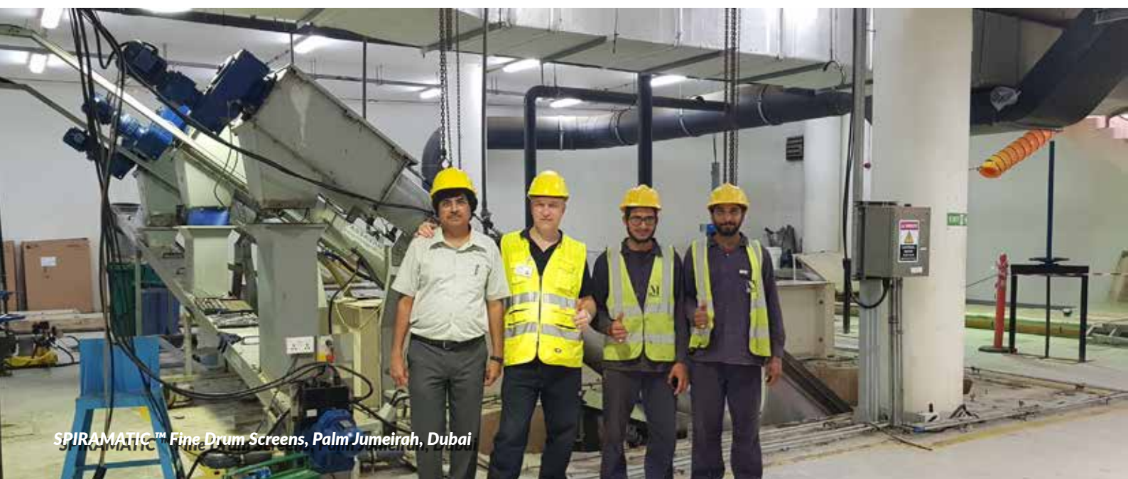
SPIRAMATIC™ Fine Drum Screens, Palm Jumeirah, Dubai