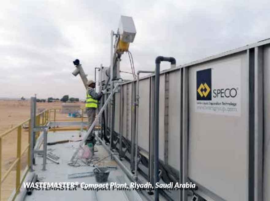
WASTEMASTER® Compact Plant, Riyadh, Saudi Arabia