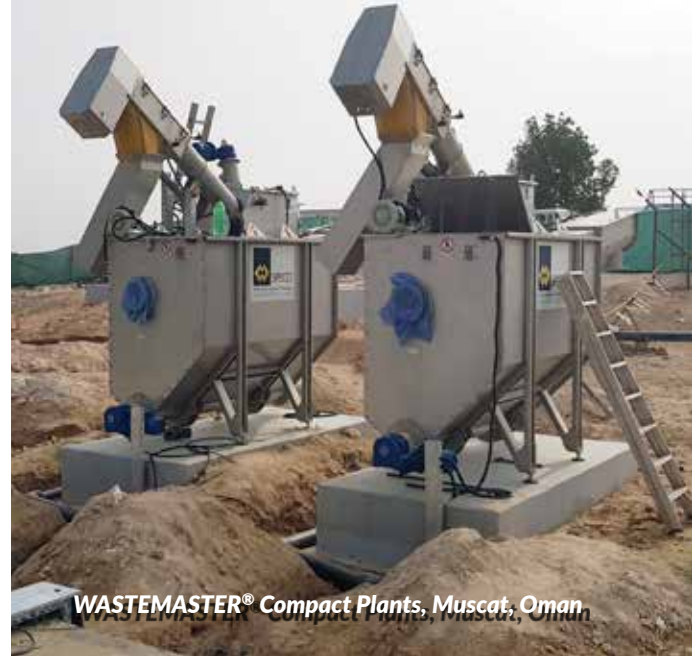
WASTEMASTER® Compact Plants, Muscat, Oman