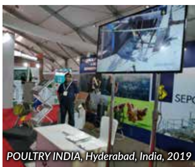
POULTRY INDIA, Hyderabad, India, 2019