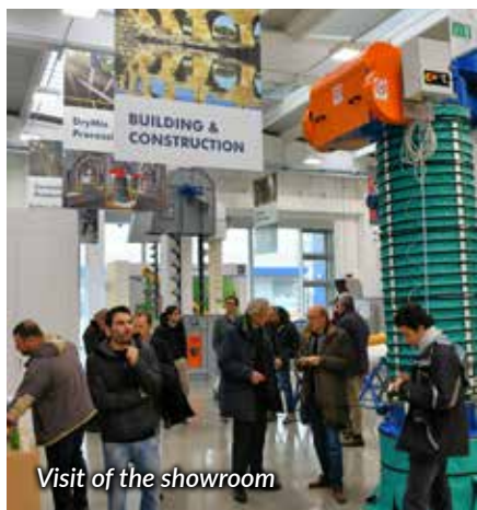
Visit of the showroom

The mission of Associazione Meccanica from Bologna is to develop a culture that reflects the values and professionalism of a company, to raise the profile of technicians, to contribute to their continuous training and professional updating. Among the 400 members of the association are executives, professionals, managers and technicians.